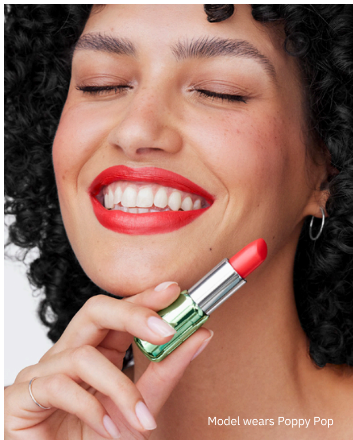
Model wears Poppy Pop